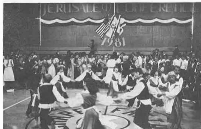
One of the dance groups performing an Israeli dance