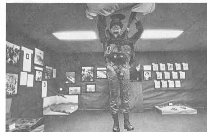
Israeli paratrooper about to land in Israeli Defence Forces Exhibit