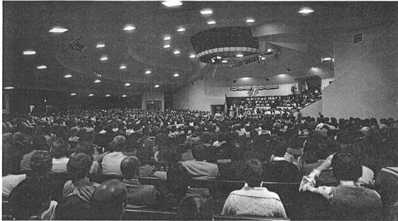
Audience of 1,500 in Sanctuary listening to International Singers during Jerusalem Conference