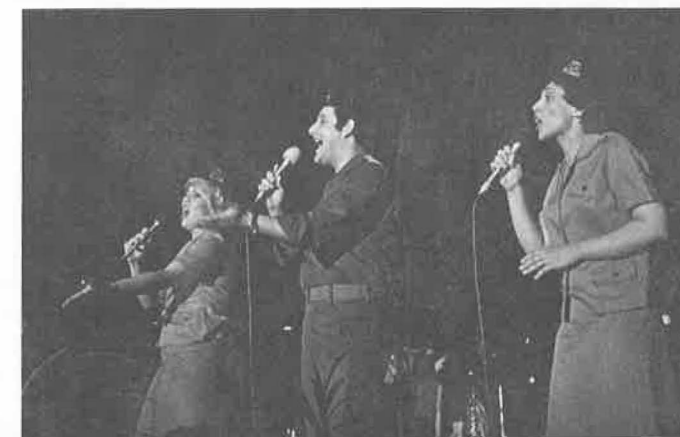
International Singers performing American-Israel Medley on stage