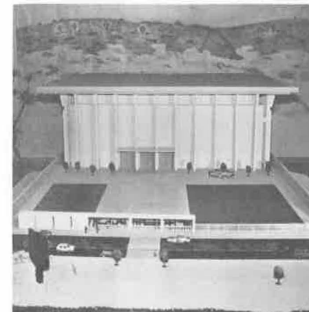
Gen. Nir with models of Israel jets; Knesset