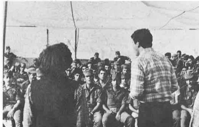
Performing for small group at army camp in Jordan Valley