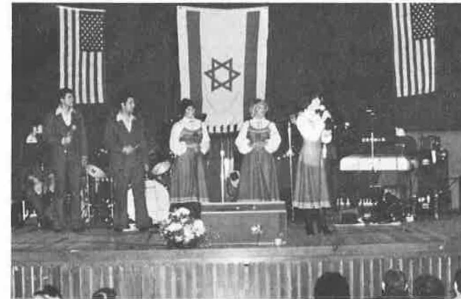
Singers on stage at kibbutz Ramat Efa'al