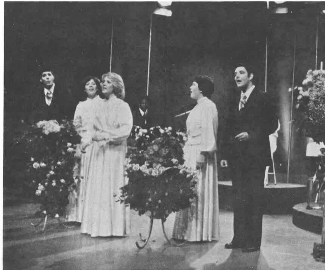
International Singers in Jerusalem TV studio

The International Singers did a superb job of imparting a message of love and solidarity with Israel on their recent tour. It is my prayer that Israel won't have to feel alone in this hour of history.