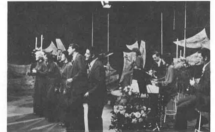
Making videotape for special TV appearance