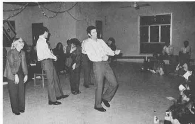
"When I say you laugh . . . everybody will be laughing"