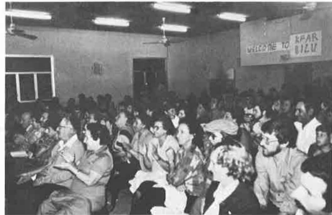
A delighted audience at Kfar Bilu