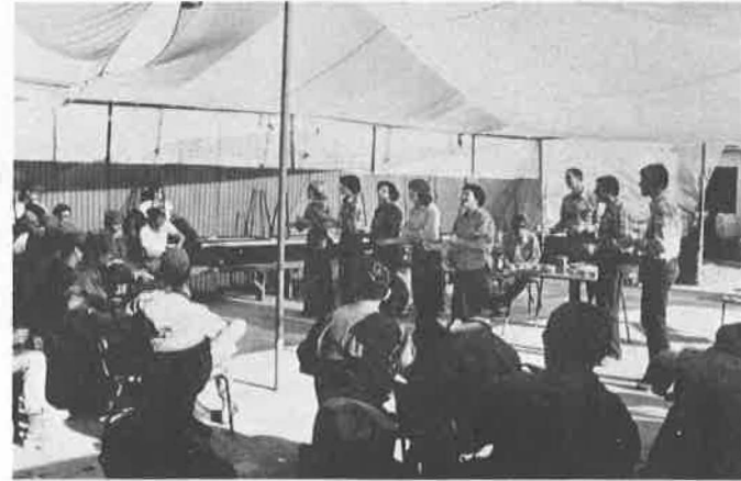
Presenting the ever-popular "Goldilocks and the Three Bears"